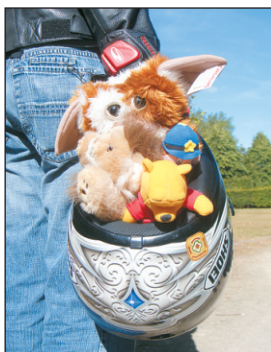
TOYS R Us fears lid thieves